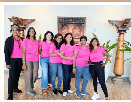
GIRLS TRIP TO SRI LANKA