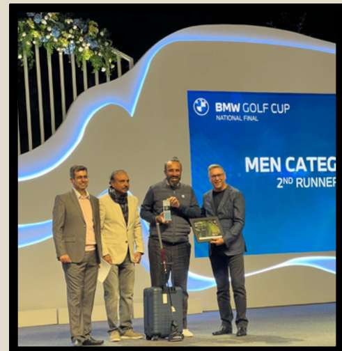
BMW Golf - December