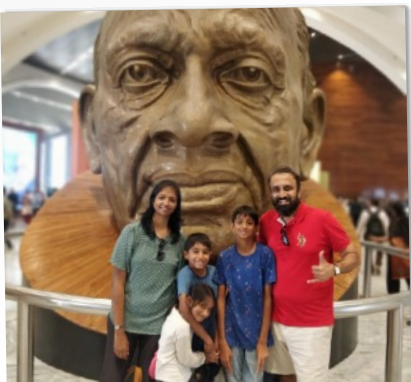
GUJARAT JAN 2020

We wish that all of us remain healthier in a peaceful world in 2021!!