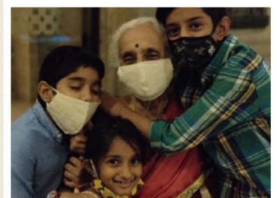
AMMA TURNED 70